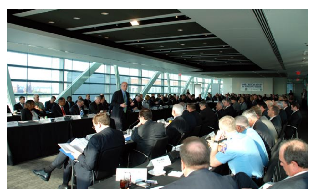
The PERF Summit was held at the Newseum, Washington, D.C.'s new museum about the history and practice of journalism.

At the Summit, chiefs and sheriffs said that while the budget cuts that they have already implemented were relatively small, the outlook for the next fiscal year is much worse. A number of chiefs