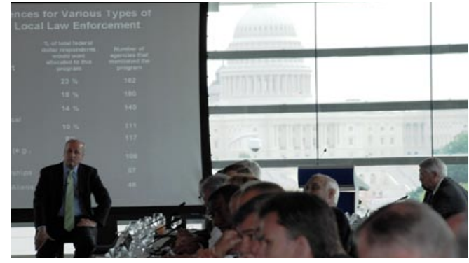
Vol. 22, No. 10 | October 2008

McCain and Obama Campaign Officials Offer Crime-Fighting Programs at PERF Summit PAGE 6