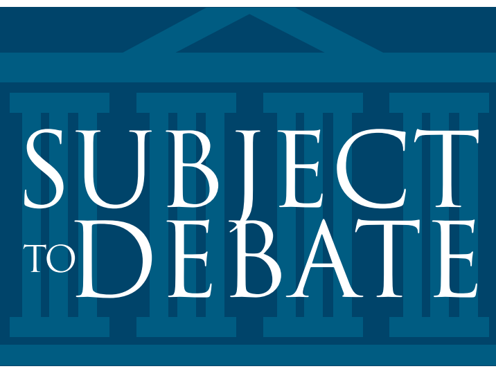
A NEWSLETTER OF THE POLICE EXECUTIVE RESEARCH FORUM

McCain and Obama Campaign Officials Offer Crime-Fighting Programs at PERF Summit PAGE 6