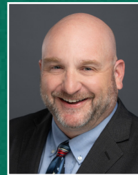
David Rogers Place 6