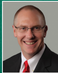
Mike Heath Place 5