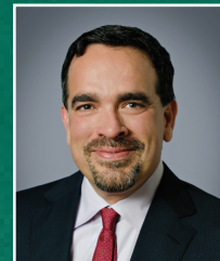
Omar Peña Place 3 Mayor Pro Tem