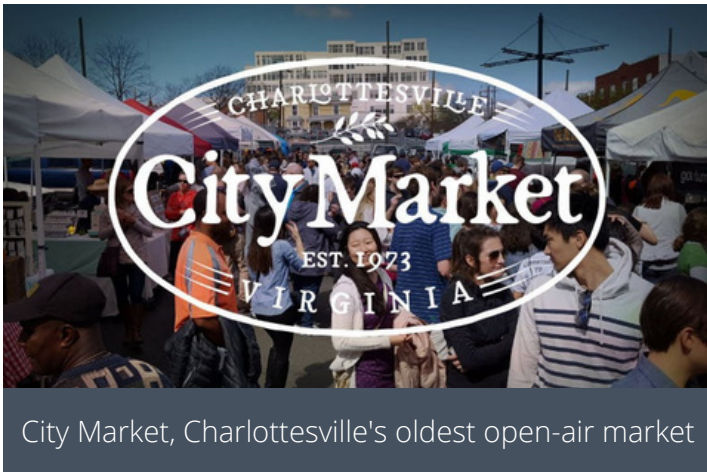
City Market, Charlottesville's oldest open-air market

Situated in central Virginia – along the Rivanna River about 120 miles southwest of Washington, D.C and 70 miles northwest of Richmond, VA – Charlottesville is a city of around 47,000 residents and home to world-class wineries, outdoor recreation, history, dining, art, cultural events, and the University of Virginia.