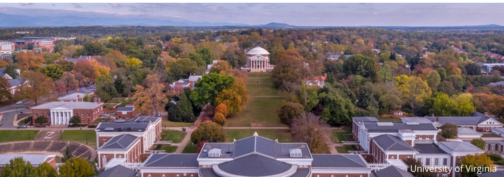
University of Virginia

The Paramount Theater's mission is to educate, enchant, enrich, and enlighten by presenting a wide variety of arts, education, and entertainment opportunities for everyone to enjoy.