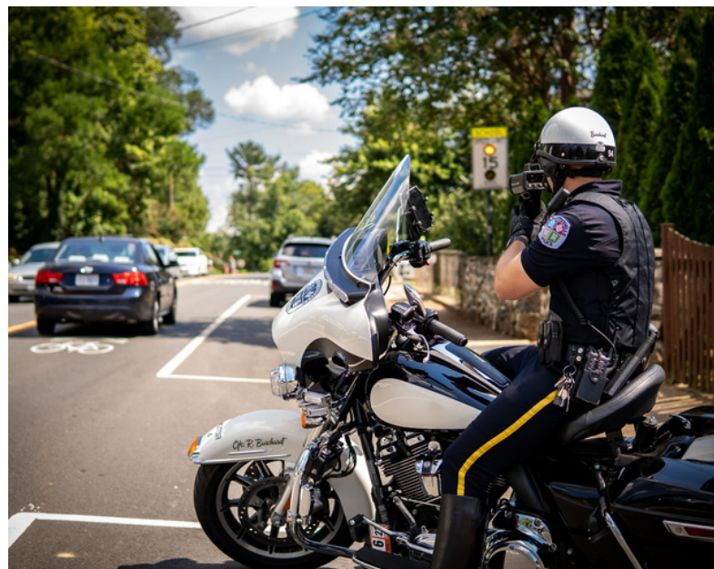
Left: An expanded crossing guard crew Right: CPD Officer monitors traffic speed on the first day of the 2022-23 School Year