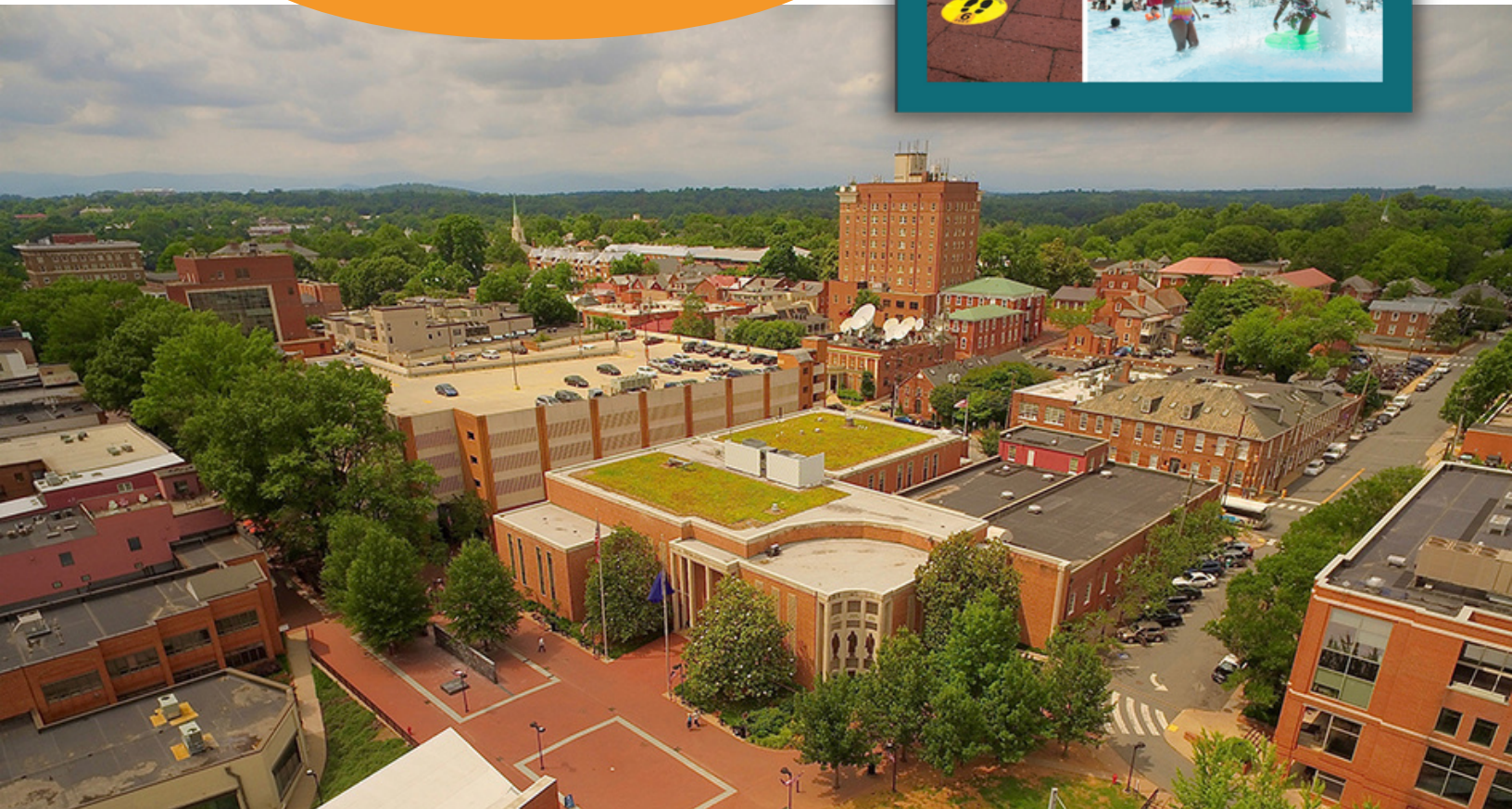
Charlottesville installed green roofs on City Hall and the Police Annex in 2008