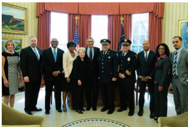
President Obama with members of the President's Task Force on 21 st Century Policing.

Sheriffs understand the 'community engagement and dialogue' area very well, given our position in the community. We have a firsthand understanding of the importance of positive community relations and the role that these relations play in solving crime and building safer communities. In fact, we couldn't do our jobs without the support, engagement and cooperation of the public.