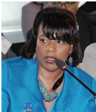
Dr. Bernice King, The King Center

We as leaders are responsible to ensure all of our cops recognize that community relations and community engagement are the responsibility of every police officer—from the day they join this police department. It's not just crime reduction and locking up bad guys. Every interaction an officer has