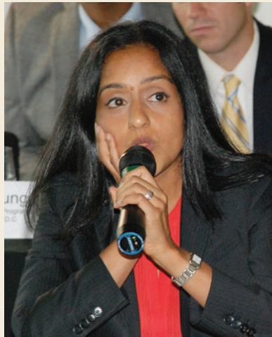
LEFT: Assistant Attorney General Vanita Gupta

The second thing I want to mention is that BJA is focusing more on de-escalation, because we do a lot of law enforcement training—or I like the term “education”—to prevent unnecessary use of force, but we don't teach officers practical skills on how to deescalate conflicts.