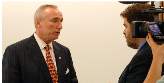
Chief William Bratton takes questions from a reporter outside the Senate hearing room regarding Sen. Jim Webb's criminal justice commission legislation.

Senator Webb's original version of the bill included language reflecting his view that the justice system is "broken," and specifically that the United States relies too heavily on incarceration, especially for low-level drug offenders. However, when the Senate Judiciary Committee took up his bill, it approved an amendment by Sen. Arlen Specter (D-Pa.) that removes that language, and